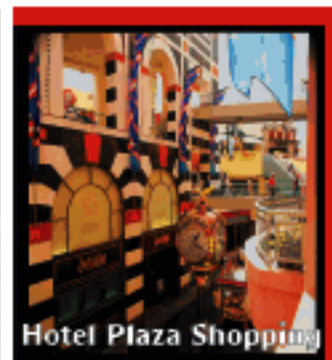
Hotel Plaza Shopping