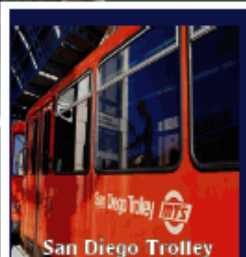
San Diego Trolley