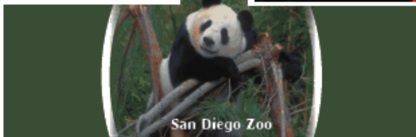
San Diego Zoo