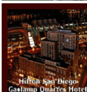
Hilton San Diego Gaslamp Quarter Hotel