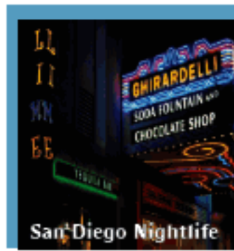
San Diego Nightlife